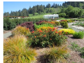
HUMBOLDT BOTANICAL GARDEN

From the north, PenAir flies from Portland, Oregon to the Eureka/Arcata airport. An alternative to flying directly to Eureka from Portland might be to fly to Crescent City or to Medford, Oregon, then rent a car. Drive time from Crescent City is about two hours; from Medford about four hours. Both routes are quite scenic, with wild rivers, rugged mountains and redwood forests well worth visiting. Several car rental agencies operate at the Eureka/Arcata airport. The Red Lion Hotel offers free shuttle service for convention attendees to and from the Eureka/Arcata airport. However you choose to get here, we look forward to hosting you and showing you our beautiful northwest corner of California.