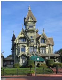
THE CARSON MANSION

For many ARS members, seeing the Redwoods ( Sequoia sempervirens ) is high on the must see "bucket list", as are the rugged North Coast of California with its Rhododendron macrophyllum and Stagecoach Hill, the home of the Smith-Mossman 1966 collections of Rhododendron occidentale azaleas.