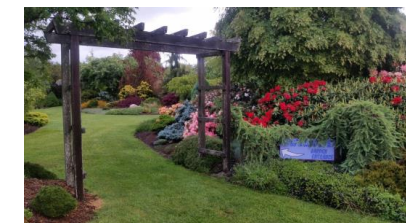
SINGING TREE GARDENS

In addition to the area's redwood parks and other natural wonders, Eureka and its neighboring towns abound with well-preserved Victorian homes displaying the famous Queen Anne "Carpenter Gothic" style. The Carson Mansion (now a private club) is the most famous example from the late 19 th century era of the lumber barons in northwestern California.